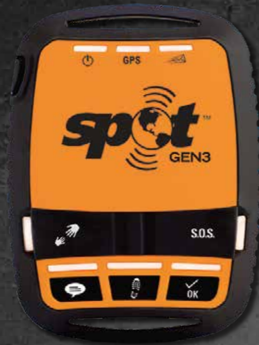
Pictured at actual size. 8.72 x 6.5cm.

Add this rugged, pocket sized device to your essential gear and stay connected wherever you roam.